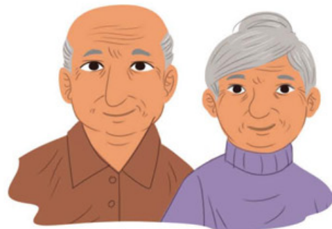
Alexander and Leila

Meena has a brother, Sanjay. Sanjay is Kavita and Ravi's 1 uncle ..... and Sanjay's wife is their 2 ..... . Sanjay and his wife have one son, Prem. Prem is an 3 ..... . Henry's parents are still alive. Alexander is Henry's 4 ..... and his 5 ..... Leila is Henry's 6 ..... . Alexander and Leila have three 7 ..... -Amelia, Ivan and George. Ivan and George and their 8 ..... , Anne and Meena, love their 9 ..... and visit them as often as possible.